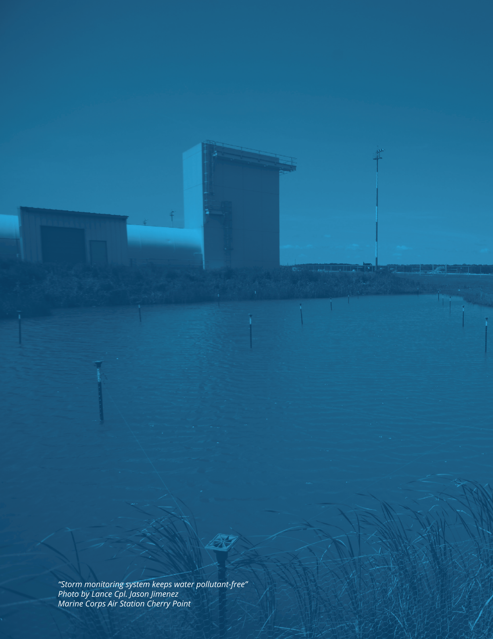
"Storm monitoring system keeps water pollutant-free"